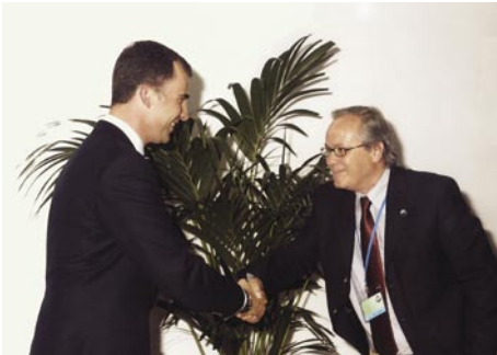
HRH The Prince of Asturias and the coordinator of the Starlight initiative during the meeting held on the occasion of the GTC First Light Ceremony.